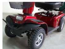
Front bumper & headlight