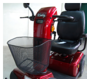
Hand brake, basket, mirror & indicators