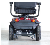
Rear bumper, indicators & anti-tip wheels